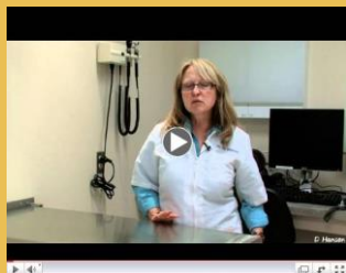
A Vet Discusses Dog Pregnancy

And a lovely, somewhat romantic whelping video: